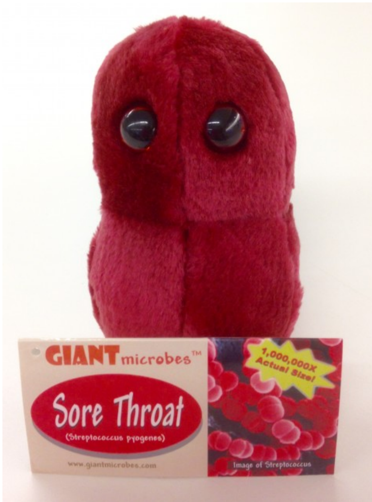
A squeezable (throttleeable?) plush strep bacterium, this week's second prize.

GOD: also it sleeps upside down like an idiot